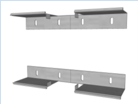
Layout for continuous array of panels